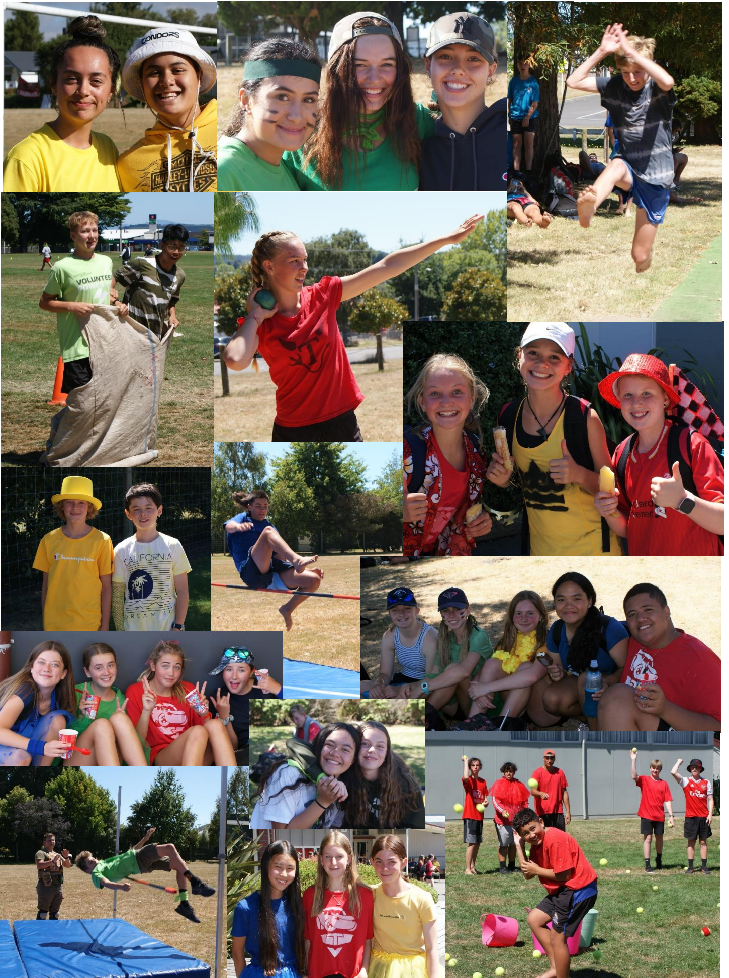
Colours Day 2021 Colours Day 2021 Colours Day