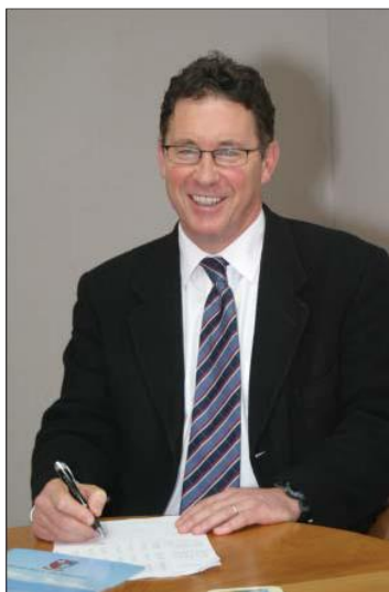
Tena Koutou Katoa

Taupo-nui-a-Tia College “Gateway to Your Future”