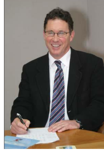
Tena Koutou Katoa

I hope all of you were able to find plenty of positives to life in Alert Level 4 of the pandemic. Certainly for me, the chance to exercise and enjoy Taupo's stunning scenery outweighed the inconvenience of no recycling or takeaways.