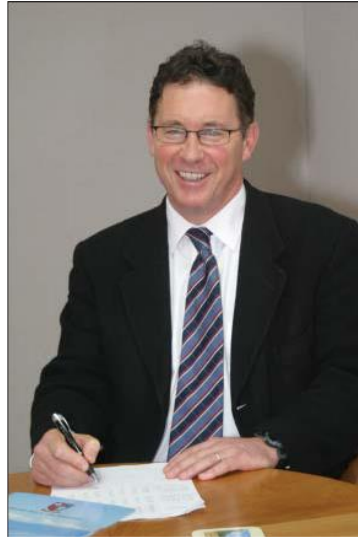
Tena Koutou katoa

Senior Prizegiving is always a great evening and an opportunity for the college to recognise the many and varied achievements of our wonderful students. I am exceptionally proud of the students leaving this school and always enjoy tracking their progress in later years. As I stated in my prizegiving address, the path to achieving education and career goals is no longer a straight forward, linear track for our young people. Unlike a few decades ago, many of our leavers will re-train, change tack and switch careers, or start studying long after their school days are behind them. Learning is a lifelong pursuit and I hope we have enabled our graduates the foundation to go out into the world and seize the opportunities that are out there.