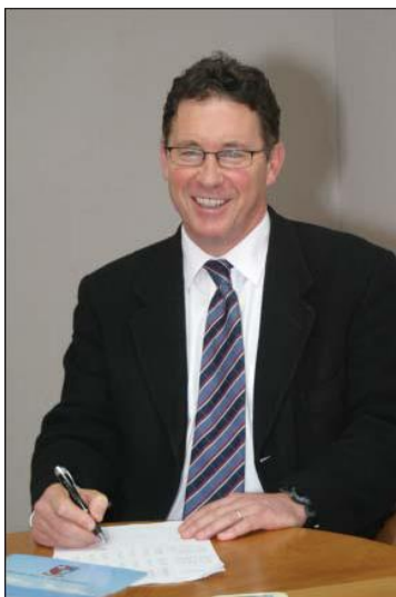
Tena Koutou katoa

Thank you to those parents that responded to our survey earlier this term. The 90-minute period received the thumbs up with 70.7% strongly agreeing or agreeing with the change and 15.6% were neutral. Finding even stronger support was the new start and end of the school day (74%). Interestingly, 46.6% did not want mobile phones being banned at school with 28.6% supporting a ban. Those that voted banning phones cited the distraction they cause and social media bullying. Those that were opposed to the ban felt the need to be able to contact their children and vice versa – especially if there was an emergency. Common to both groups was the feeling that phones need to be banned in class because of the distraction they cause. This is currently the case with cellphones, and we have included the rules regarding these devices in this newsletter.