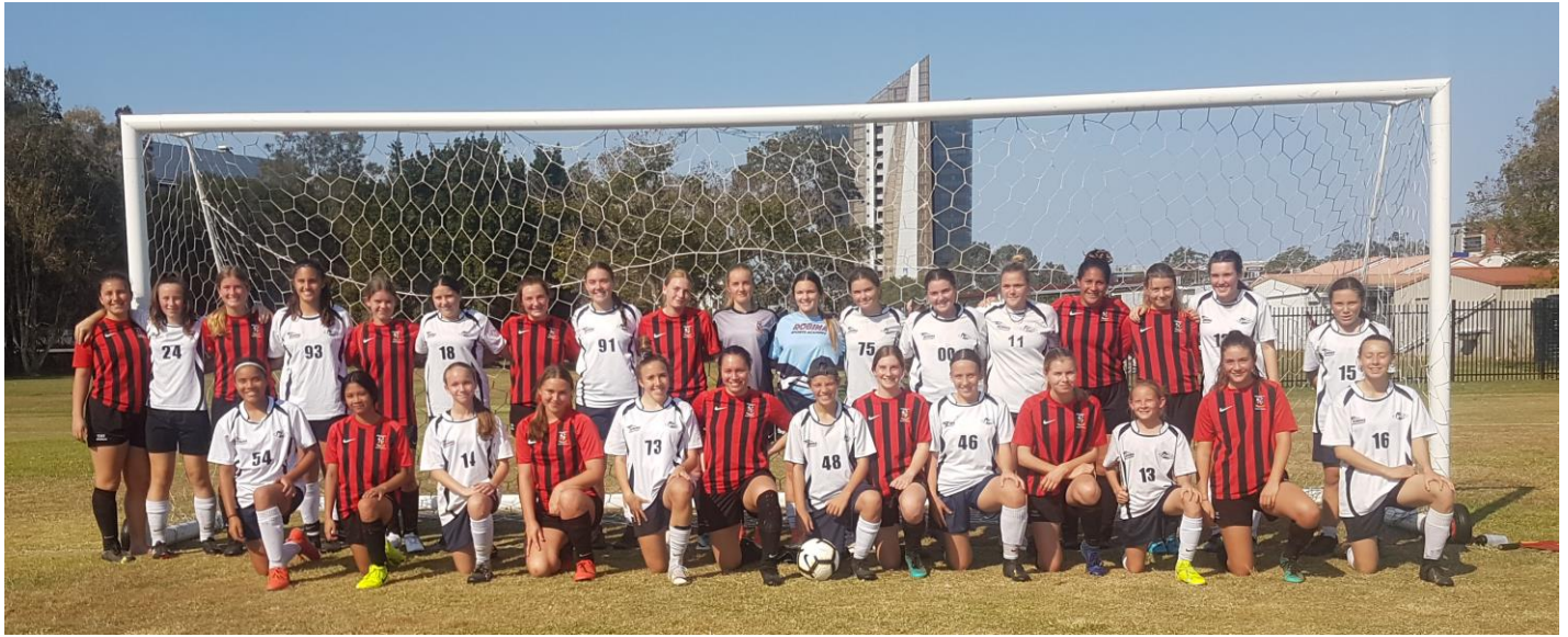
Girls Soccer Australia Trip – Vs Robina High School