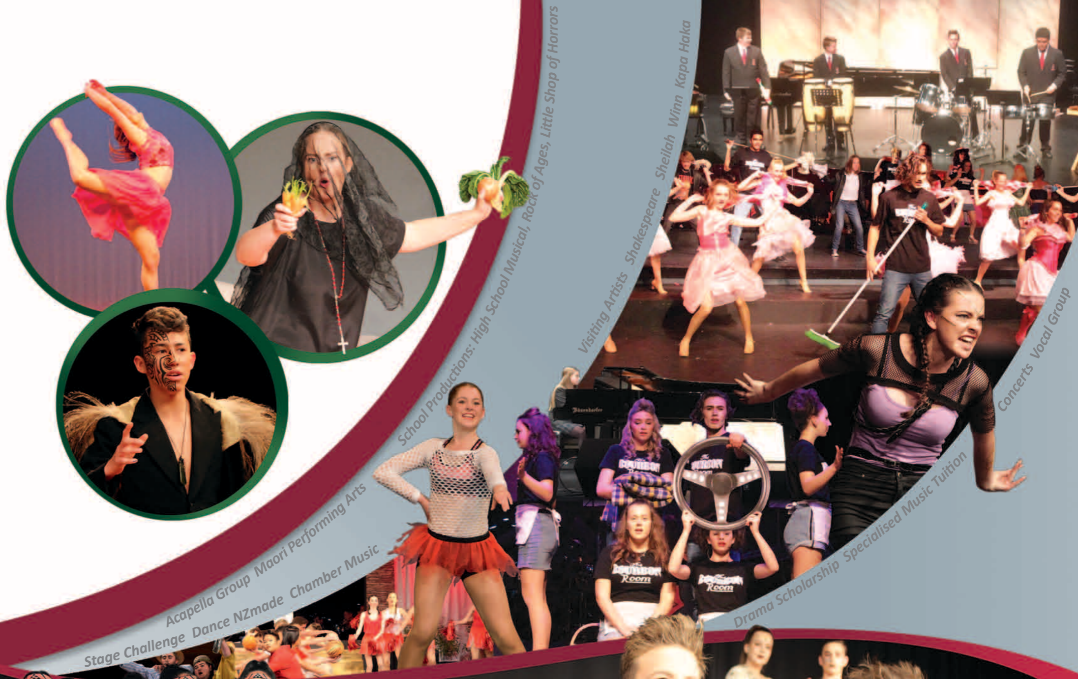
Acapella Group Maori Performing Arts Stage Challenge Dance NZmade Chamber Music