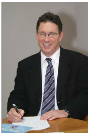
Tena Koutou katoa

This term is in full swing with staff and students adapting positively to 90-minute periods. Our music, drama and kapa haka students have been rehearsing for public performances in regional and national competitions, and winter sports are well underway.