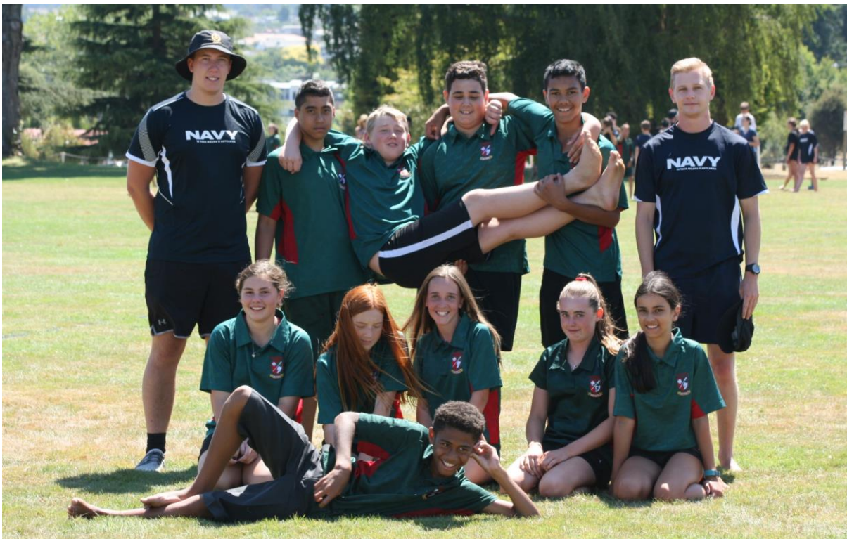
Recent Navy Visit – Team Building with Year 9 Students