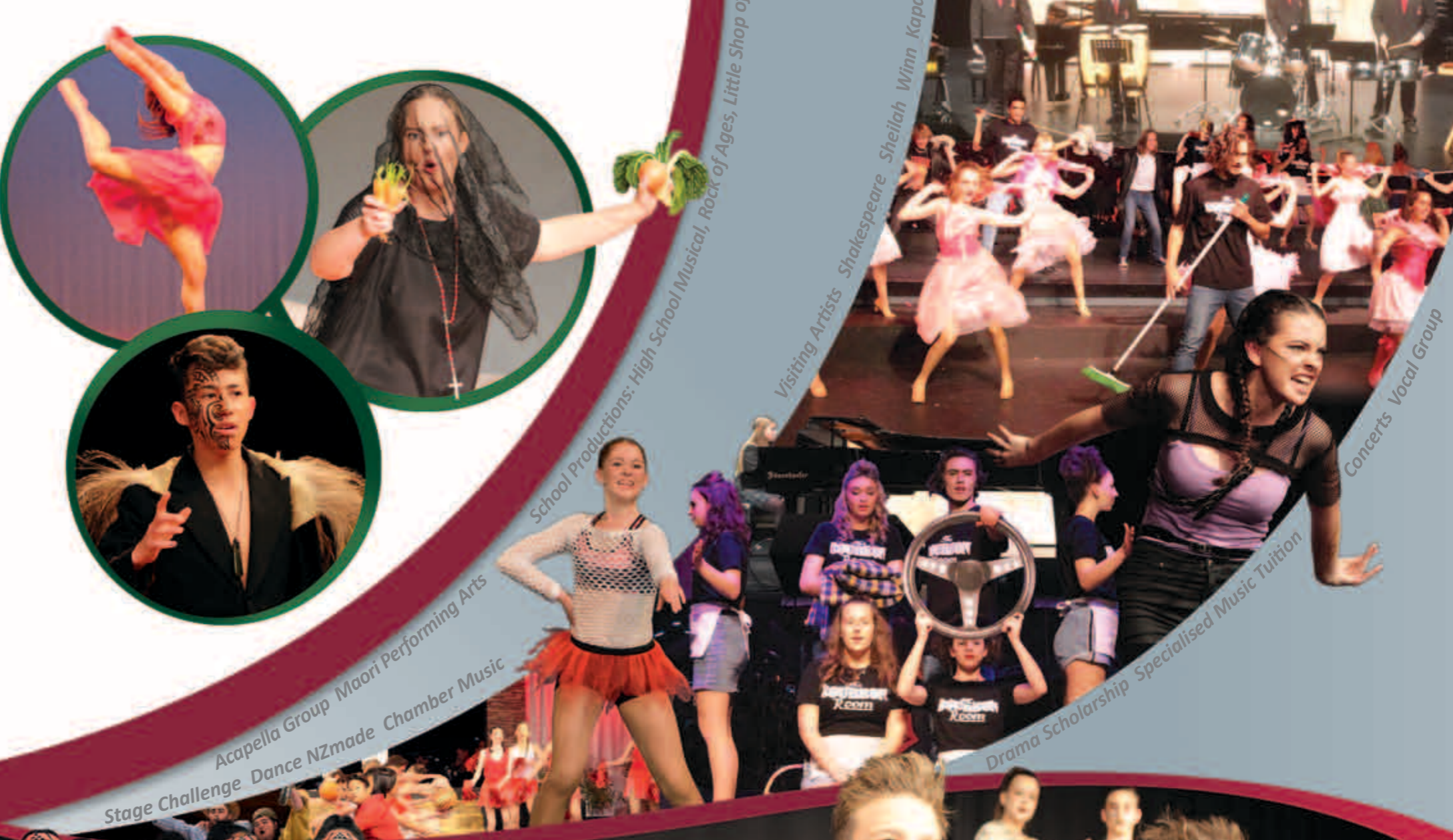
Acapella Group Maori Performing Arts Stage Challenge Dance NZmade Chamber Music